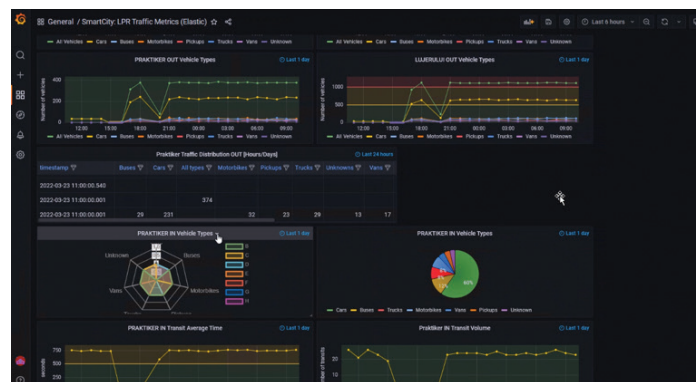
Custom dashboard view