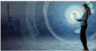
Autonomous Wave Control (AWC)

Suminac choose to reduce their IT administration effort by leveraging the power of Allied Telesis hosted management services. Rather than have to supply their own local server resources for management applications, they now benefit from online AWC wireless management, along with access to the Vista Manager EX network administration platform for easy-to-use visual monitoring and management tools – all hosted by Allied Telesis in the cloud.