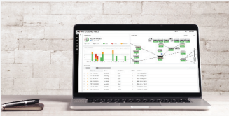
Vista Manager EX